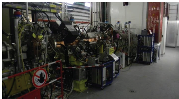
Figure 1: The Linac4 3 MeV section (from right: ion source, RFQ, chopper line) installed in the tunnel.

Following this initial commissioning phase, the 3 MeV injector and the measurement line were installed in their final location in the linac tunnel (Fig. 1) where another set of extensive beam measurements took place between end 2013 and beginning of 2014. The beam measurement line was then moved downstream in preparation for installation and beam commissioning of the first Drift Tube Linac (DTL) tank that has recently been assembled and tuned. In parallel, a new Cesiated version of the RF-type ion source was installed and commissioned in the test stand. It delivers a current of more than 50 mA and will be installed in the linac during summer 2014, to be used for the commissioning of the other two DTL tanks going up to 50 MeV and of the remaining linac sections.