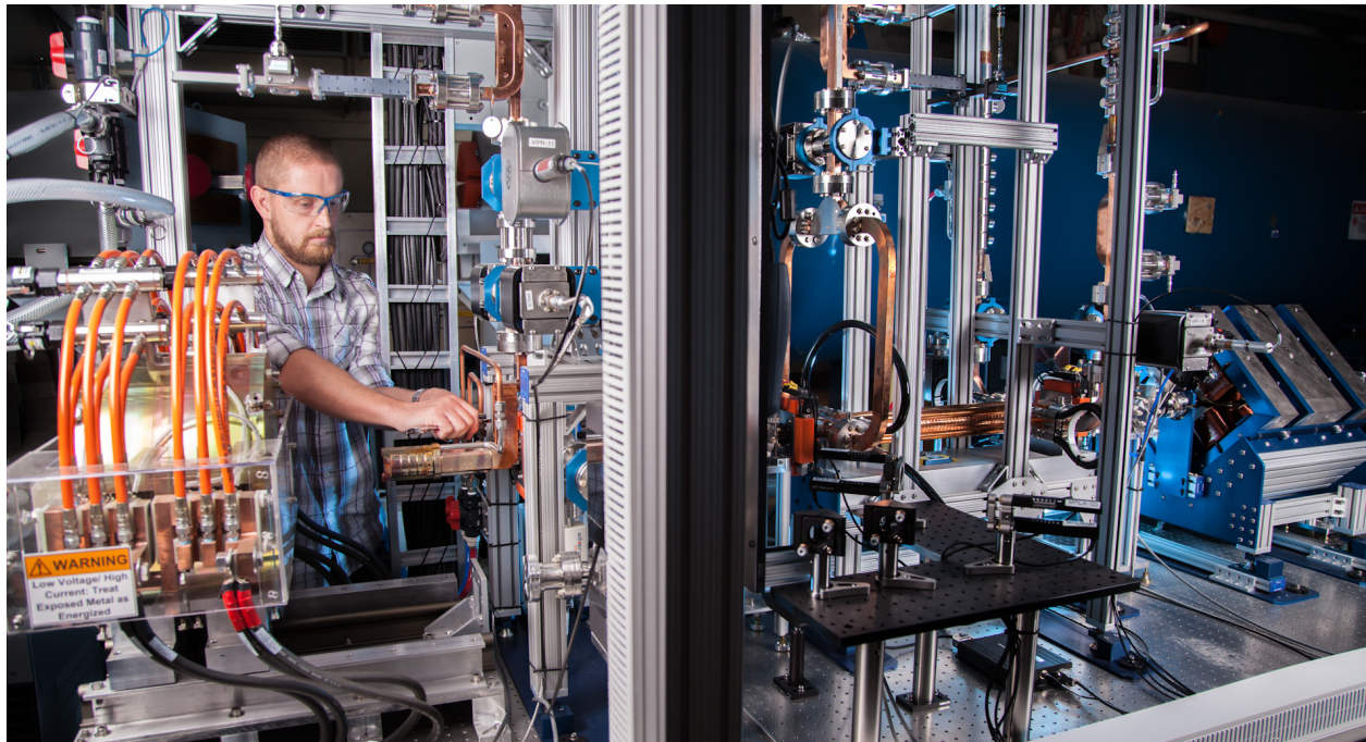
Figure 2: Photograph of the X-band test station.

mounted together in triplets, with each stand having adjustability. The steering magnets are mounted onto beam-line vacuum flanges.