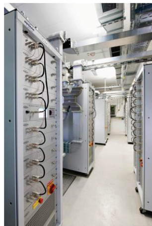
Figure 2: The new SSPA gallery at ELBE.