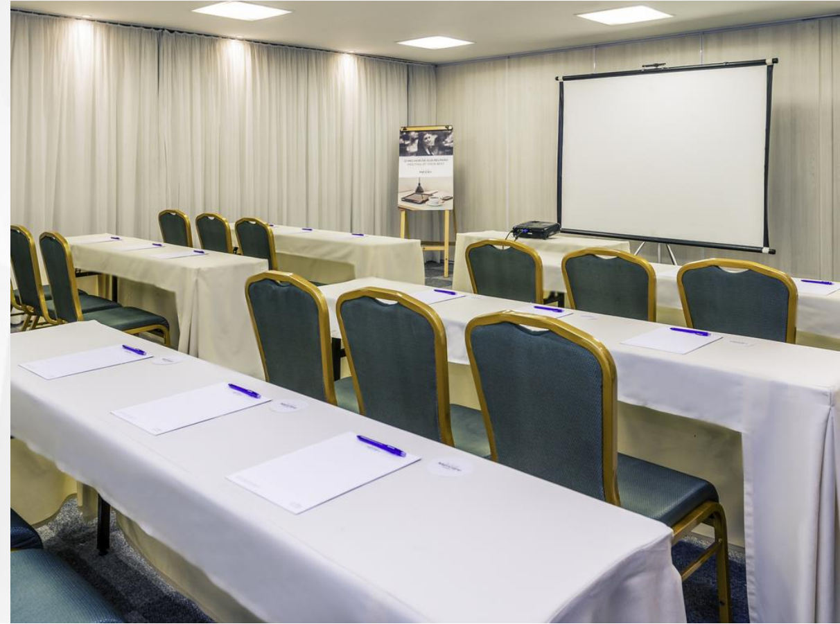
'Coliseu' Room | 49m 2

*Rooms can be set in different configurations