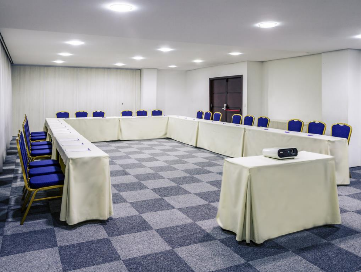
'Vila' Room | 90m 2