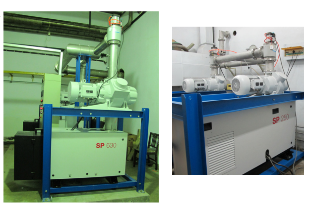
Figure 3: The new rough pumping stations of SSC and SFC

The oil mechanical pumps which cause the serious contamination to the vacuum chambers were used for the rough pumping systems of SFC and SSC for many years. In August, 2010, during the accelerators shutdown period, the rough pumping systems were rebuilt. The oil pump units were changed by large dry mechanical pumps with a pumping speed of 630m<sup>3</sup>/h and 250m<sup>3</sup>/h for SSC and SFC respectively (Fig.3). As a result, the oil vapour in two cyclotrons will be eliminated and the vacuum condition of them will be improved.