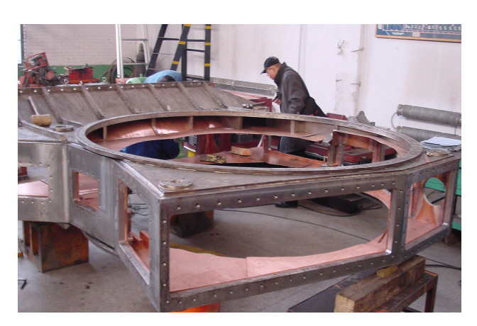
Figure 1: SFC double-deck vacuum chamber