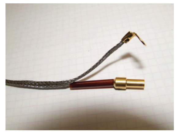
Figure 2: Modified electrical connection for the intermediate electrode.

To improve the amount of lead available from the source an attempt was made to fill the sample with liquid lead. But it turned out that for the operation a higher oven power was needed and that the output hole of the oven became clogged much faster with lead oxide (see Figure 3), actually leading to a reduction in lifetime. So this was discarded for the operation.