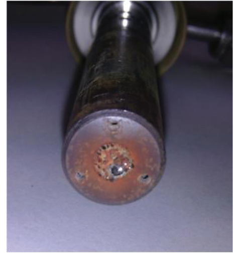
Figure 3: Oven tip clogged with lead and lead oxide.

To improve the amount of lead available from the source an attempt was made to fill the sample with liquid lead. But it turned out that for the operation a higher oven power was needed and that the output hole of the oven became clogged much faster with lead oxide (see Figure 3), actually leading to a reduction in lifetime. So this was discarded for the operation.