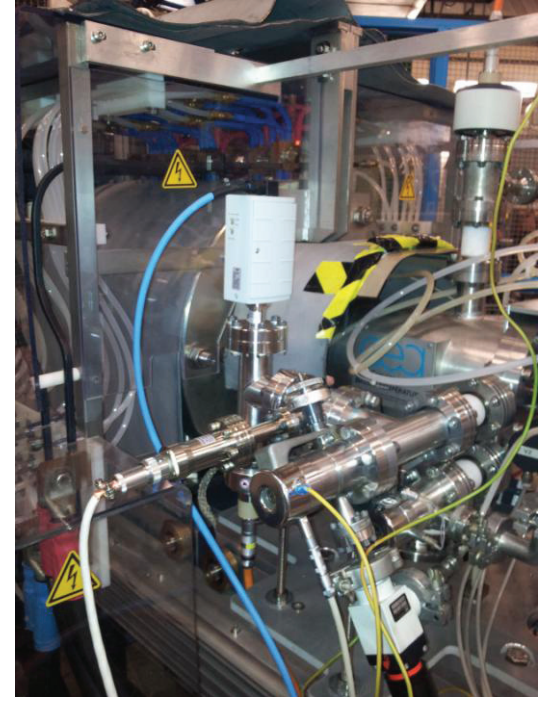
Figure 1: Gas injection with new gauge (in the center of the picture) for gas injection feedback loop.

• The gas injection feedback loop was sensitive to the microwaves injected into the source. This has been improved with a different gauge type (IMR265 by Pfeiffer) installed close to the gas injection valve that could be used for the feedback loop (see Figure 1). This eliminated the sensitivity to the microwave and in addition it smooths out any (fast) pressure fluctuations in the source.