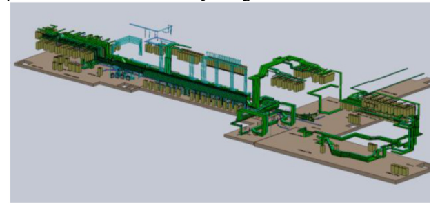
Figure 2: 3D view showing the electrical distributions for the process in the building.

validated. Figure 2 gives an example just limited of the process electrical cable tray integration.