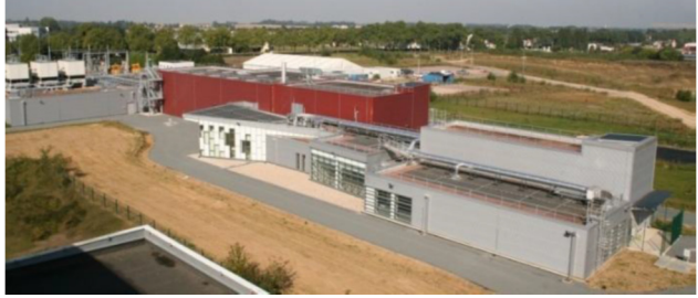
Figure 7: Completion of the SPIRAL2 building (October 2014). The beam axis is 8 meters underground.

During the construction, several inspections were made by the French Safety Authorities, in order to check the conformity of the building with respect to the safety requirements (confinement barriers, earthquake resistance...).