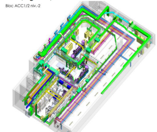
Figure 4: 3D views of processes + connections + buildings.

• A 3D high definition global integration without spatial interference (Figure 4).