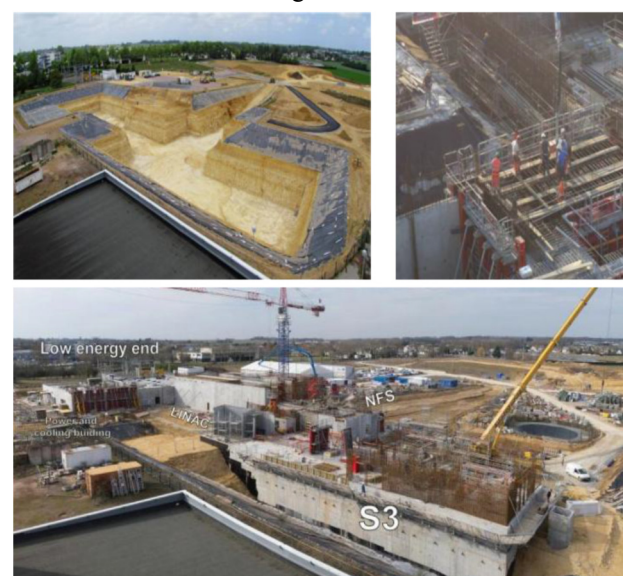
Figure 6: Views of the construction site under way.

In October 2014, 14000 m<sup>3</sup> of concrete were poured, thanks to 450 000 work hours, and up to 120 workers on site. This can be seen in Figure 7.