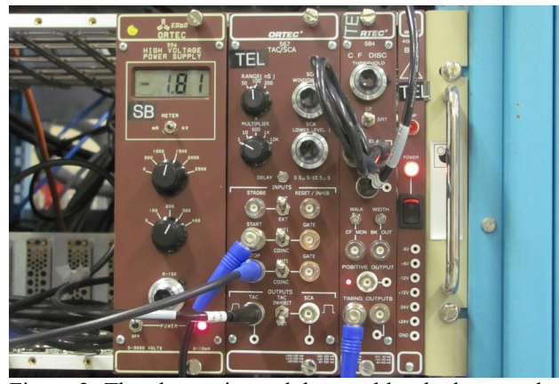
Figure 2: The electronic modules used by the beam pulse monitor system. From left to right: high voltage supply for the BaF2 detector (Ortec 556), time-to-analog converter (Ortec 567) and constant fraction discriminator (Ortec 584). The Single Channel Analyser in the TAC module is not used. The modules are installed in an Ortec 4001C NIM bin.

deposited by the detected \gamma -ray is not always the same, so in order to produce an accurate timing signal that is not depended on the amplitude of the detector pulse, an Ortec 584 constant fraction discriminator (CFD) is placed between the detector and the TAC. The fast logic signal from the CFD is then fed to the TAC's start signal input. The stop signal comes from the reference RF, which at that point is 9.375 MHz. Figure 2 shows the electronic modules comprising the monitor system. This configuration results in an event rate of the order of 5000/s for a typical beam of 50 nA, which implies that substantially less than one \gamma -ray per beam pulse is produced. The output of the TAC is connected to a multichannel analyser (MCA) which produces a histogram representing the time profile of the beam. Since a single beam pulse results in less than one gamma ray detected, over time, the profile of the beam pulse produced in the histogram is considered to be a faithful representation of the profile of the pulse.