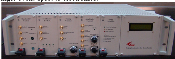
Figure 3: Layout design of scanning control cabinet.

Connections between main compute board and ions chamber electronics are via fibre optics to ensure stable and robust transmission against radiation damage and single event upset to electronics.