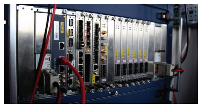
Figure 2: MTCA.4 crate in operation at DESY.

More recently, DESY has also begun to operate demonstration and test systems which can be used to run model applications in a controlled lab environment on site; a mobile version which can be temporarily shipped out to future collaborators for off-site testing is currently in preparation, see Fig. 2.