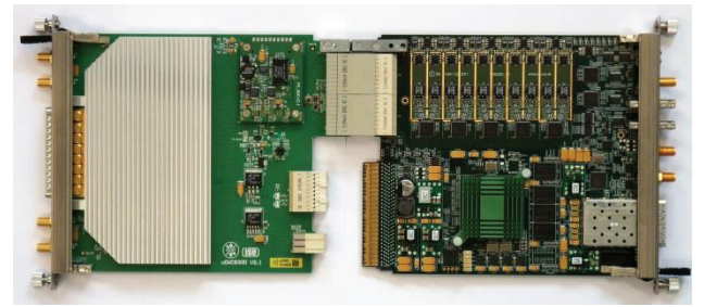
Figure 1: Pair of MTCA boards connected via Zone 3.

MTCA (also known as µTCA or MicroTCA, an abbreviation of Micro Telecommunications Computing Architecture) has evolved as a standard in the telecommunications industry from ATCA (Advanced Telecommunications Computing Architecture), a larger predecessor now dominating most of the market for telecom switching equipment. MTCA.0 marked the base specification for a smaller derivative standard, and MTCA.1, MTCA.2 and MTCA.3 added features needed to build ruggedized systems especially for the industrial and military markets. MTCA.4, mainly championed by the physics research community, brought further improvements regarding connectivity and signal precision. Defining feature of this latest amendment is the disentanglement of interfering signal paths made possible by the separation of boards, as depicted in Fig. 1 below.