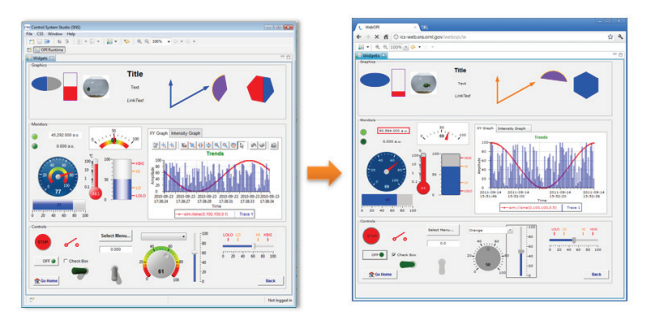
Figure 1: Comparison of same OPI running in CSS BOY and web browser.

To bring control system UIs to the Web, the ideal way is to directly run existing desktop Operator Interfaces in web browsers without extra effort. This is exactly what WebOPI does. It seamlessly executes OPI files created by CSS BOY in web browsers, without any modifications (see Fig.1).