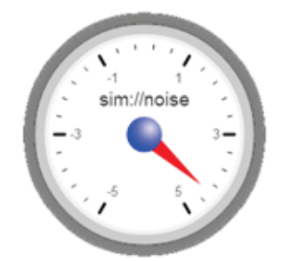
Figure 5: Pre-wrapped WebPDA widget demo.

<div class="webpda-widgets" data-widget="rgraph-gauge" data-pvname="sim://noise"></div>