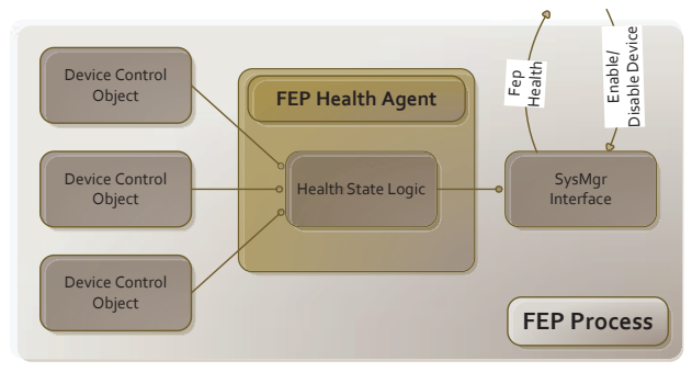
Figure 1: FEP Health Monitor Agent.

The Device Health Monitoring framework has two main components. The first is a singleton FEP health agent that is instantiated in each FEP process and acts as a device state aggregator and reporter (Figure 1). The second component is the extension of the System Manager GUI to receive and display the new FEP process 'unhealthy' state (Figure 2).