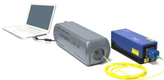
Figure 1: High Finesse Wavelength measuring device interfacing a windows computer and a light source.

For the purpose of integrating measurement results from this device into custom applications, all program values and settings are accessible for user via calls to a dynamic linked library (DLL) called wlmData.dll routines. The wlmData.dll uses shared memory for inter-process communication. The software requires that the server (the Wavelength Meter application) and the clients (any access and control programs) access the same DLL file and not just identical copies which leads to limiting the use of the interface software to one instance at a given time. Elimination of restriction of use of DLL by one client at a time and integrating the whole setup with in-house controls is important to make use of existing infrastructure and correlate data measurements.