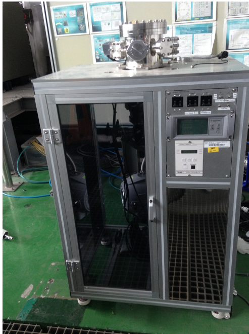
Figure 4: Demo vacuum control system with turbo pump and several vacuum gauges.