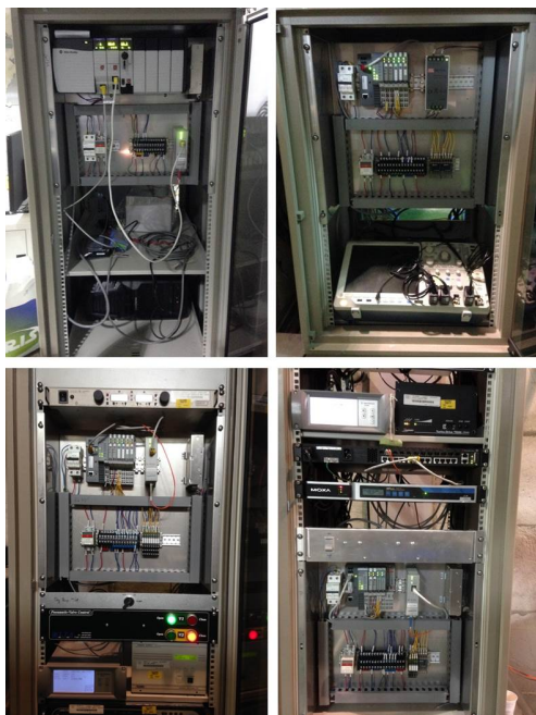
Figure 2: Installed chassis on each platform to configure the vacuum interlock system of the ECR ion source.