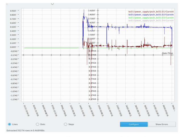
Figure 3: HdbExtractor++ multiline plot.

The HdbExtractor++ multithread library allows fetching the data from the legacy HDB and the new HDB++ MySQL schema in a simple Object Oriented way. An additional module provides a Qt interface to the HdbExtractor++ and a dedicated GUI, exploiting the MathGL framework, aimed at displaying mono and bidimensional data over time. Also, possible errors conveniently stored in the database can be found an displayed. Figure 3 and 4 show a multiline plot and a surface plot.