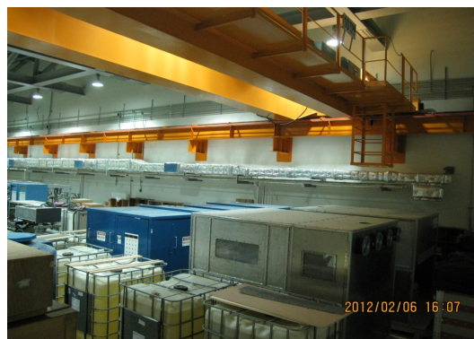
Figure 4: 4 sets of modulators ready to installation.