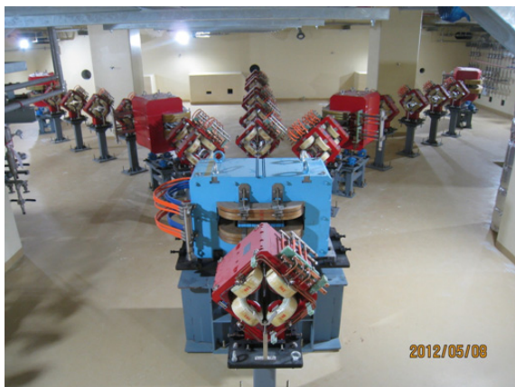
Figure 7: The installed 20-MeV beam line magnets in the 20-MeV beam line hall.