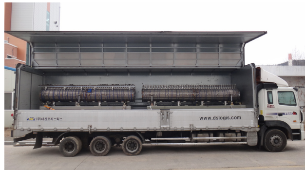
Figure 2: 20-MeV DTL tanks on the vibration free truck for the movement to Gyeongju site.

The operation of the 20-MeV linac was finished at November 2011. Since then, the linac was disassembled and was moved to the Gyeongju site at February 2012. A vibration free vehicle was used for RFQ, DTL tank delivery as well as klystron delivery as shown in Figure 2.