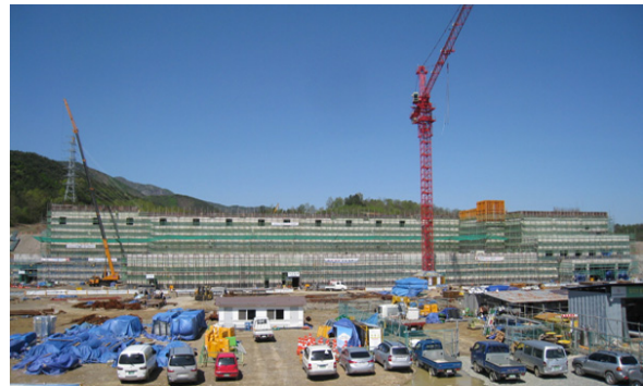
Figure 8: Construction of the accelerator building at Gyeongju project site (April 26, 2012).