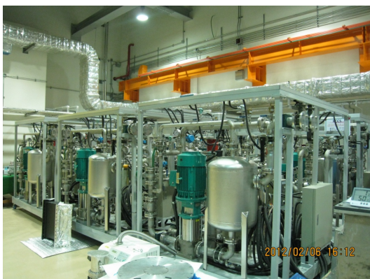
Figure 5: 11 sets of RCCSs ready to installation.