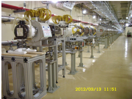
Figure 6: The installed 100-MeV linac in the tunnel.

The beam commissioning is scheduled at the end of this year. The initial goal of the beam commissioning is the beam power of 100W at the end of the 100-MeV linac. The pulse width and repetition rate are 50 \mu sec and 1Hz with the beam energy of 100 MeV and the peak beam current of 20 mA [5, 6]. The commissioning process consists of two stages. One is for a 20MeV linac and a MEBT by using a beam stop which will be installed in MEBT. The other is for 100MeV beams by using a 1-kW beam dump installed at the end of the linac.