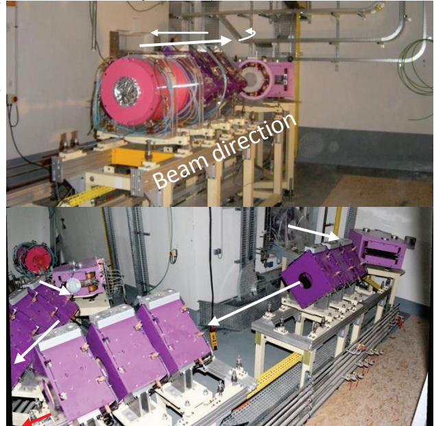
Figure 3: LEBT1 and LEBT2 installation.

A development progam is also conducted to increase the volume of the plasma chamber and improve the magnetic configuration of the Phoenix source. (LPSC, GANIL and IPN/Lyon work).