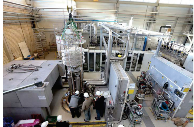
Figure 3: Vertical test cryostat at the accelerator module test facility (AMTF) while a set of 4 cavities is lowered into the cryostat for acceptance test.

exceeding it by a big margin, and 3 were re-treated and reached the goal in the second test. Detailed results will be published elsewhere as soon as a larger sample provides better statistics [6].