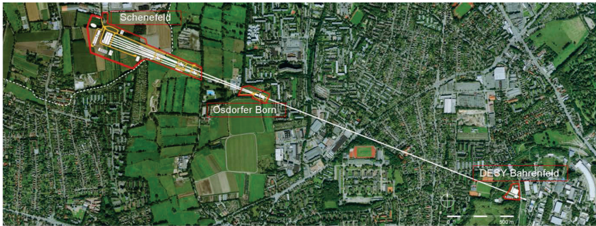
Figure 1: Bird's eye view of the European XFEL site showing the location of the three surface areas and the tunnel routing below the cities of Hamburg and Schenefeld.

experimental campus (Schenefeld) the large experimental hall, tunnel separation shafts, dump shafts, office buildings and infrastructure buildings, and a tunnel separation shaft and surface infrastructure building at the end of the main accelerator tunnel (Osdorfer Born). The whole accelerator and FEL complex spans 3.4 km to the west of the DESY campus, consisting of 5.8 km of underground tunnels and shafts. Two tunnel boring machines were deployed, one providing a tunnel diameter of 5.3 m for the main accelerator and first undulator tunnels and one for a tunnel diameter of 4.6 m in the photon tunnels. The major part of the main accelerator tunnel crosses residential and commercial area.