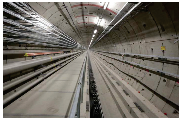
Figure 2: View of the main accelerator tunnel against the direction of the beam. On the right the cable trays are visible which will be hidden under the floor during operation.

dominated by the cabling work underneath the tunnel floor. To allow for work under the floor it is made up from 400 concrete plates resting at four points on a concrete frame. This results in unsteady positioning of the plates which is compensated in two ways. First, on the transport path the rubber dampers known from urban railways are placed under the plates to avoid long-ranging low frequency noise. Second, under the normal-conducting parts of the machine the plates are bedded into a layer of epoxy glue whose height exactly adjusts to the unevenness of the plates. The latter solution is pending confirmation.