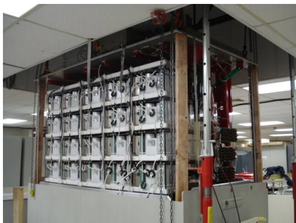
Figure 2: The ILC/KEK Marx system, showing the 20 core modules which comprise half the tank volume. Each module used fourteen series 500 V 4700 \mu F electrolytic capacitors for an effective module storage of 335 \mu F at 7 kV. Over 80% of the volume of the core modules is used by these capacitors.

The Marx Modulator is installed in an oil tank with a 53” × 88” footprint, and 52” in height. Controls reside in an oil free “doghouse” on the tank top, which holds two 6U standard rack drawers in height, by two racks in width. The interior of the tank is quite dense; the core modules comprise one entire face of the modulator interior, and the correctors and both buck regulators the other face (Fig. 2).