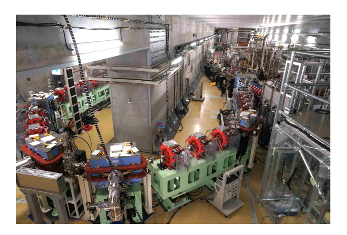
Figure 2: cERL constructed in the accelerator room.

The constructed cERL is shown in Fig. 2.