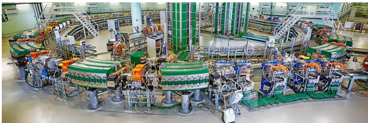
Figure 2: MedAustron synchrotron – fully installed and operational. The injection/extraction region can be seen in the front.

In order to ensure that the dose is applied as prescribed, beam parameters are online monitored and controlled during the entire treatment process. Beam intensity, position and size are supervised by redundant means in front of the patient. In case of deviations from the nominal values, the beam is switched off within less than 1 ms, ensuring the safety of the patient.