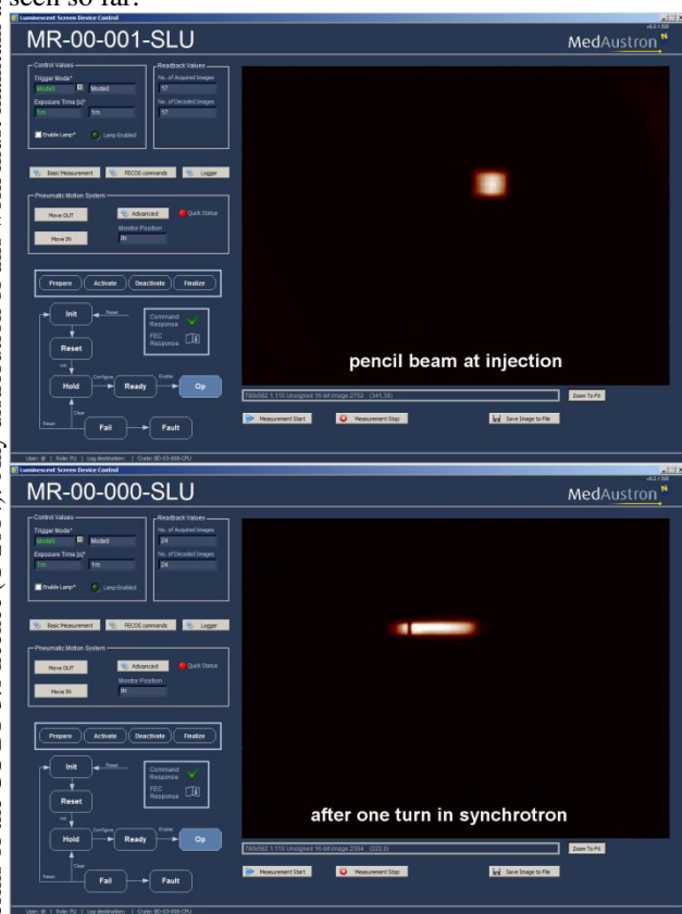
Figure 3: First turn seen on the beam screens MR-00-001-SLU (injection) and MR-00-000-SLU (after one turn).

Beginning of April'14 the first turn was achieved in the synchrotron after 1.5h by one-to-one steering using horiz. correctors and the horiz. pick-up \Delta/\Sigma -signals seen via the analog signal distribution system (SADS). A 1\mu\text{s} proton pulse at 7MeV from the injector was used, which had been shaped to a pencil beam using slits in the MEBT, see Figure 3. Not utilizing injection kickers, the injection bump was created using orbit correctors. The main dipole field was adjusted to minimize the overall orbit offsets. Applied corrections were small and consistent with expectations. No polarity or alignment errors could be seen so far.