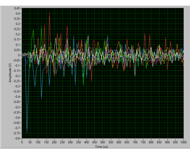
Figure 2: Strongest Modular Cavity spark signal (1 ms).

First, the signals had relatively large amplitudes at the beginning for around 50 \mu s and decayed quickly to zero in around 300 \mu s. The RF pulse duration for the MICE cavity is around 400 \mu s. A typical breakdown event will have an RF pulse cut short by about 100 \mu s. Given the noise subtraction artifact issue, this 100 \mu s is enough time to completely hide any meaningful acoustic signal from the MICE cavity. This potentially expalains why we don't see strong acoustic signals in the captured data.