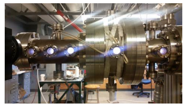
Figure 5: Pill box cavity with plasma.

The middle section of the pill box cavity is heated with the help of a heating tape to raise the temperature to compensate the decrease in etch rate due to higher asymmetry of that plasma, which is the consequence of this section's larger diameter. A closer look at Fig. 5 shows us that the plasma in third and fourth window from left shows much more intensity than the other windows as the inner electrode was positioned at that section, approximately.