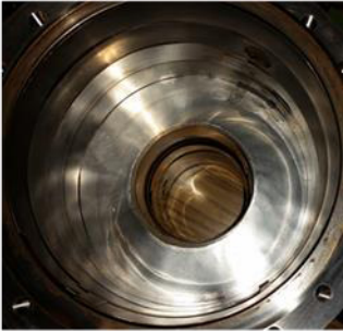
Figure 4: Niobium samples and electrode in the pill box

The concept of pill box cavity filled with Nb samples and a short electrode attached with linear translator provides an opportunity for segmented plasma production and to see the effects on the Nb placed on multiple surface. Due to complex shape of the SRF cavity it is harder to do any plasma based surface modifications uniformly on all the available surfaces. The segment wise plasma production/confinement with varied conditions optimum for that segment might be the solution. The plasma produced in the pill box cavity is shown in in Fig. 5.