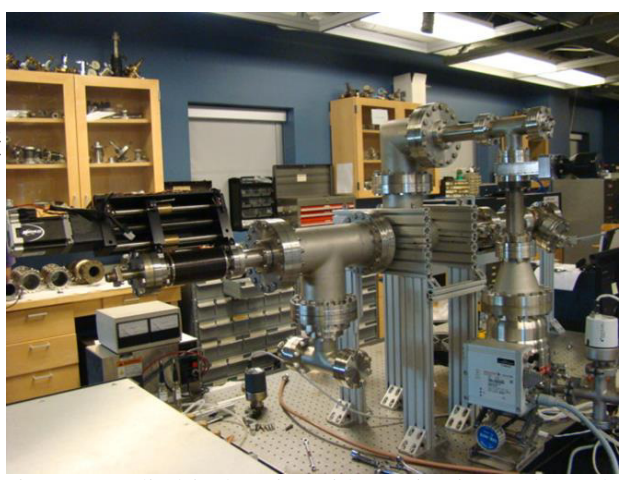
Figure 1: Cylindrical cavity with moving inner electrode for processing experiments.

The moving electrode with cylindrical cavity is shown in Fig. 1. We produced the plasma in the cylindrical cavity and moved the electrode and found that the movement of the inner electrode does not affect the plasma or etching behaviour. work.