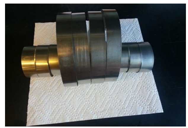
Figure 3: Different diameter Nb samples to be placed in the pill box cavity.

cavity is of 15 cm diameter and 10 cm length, which is close to cell geometry. Each cavity has four mini conflate flanges welded to it for diagnostic and sample holding purposes. This cavity is filled with different diameter Nb samples as shown in the Fig. 3.