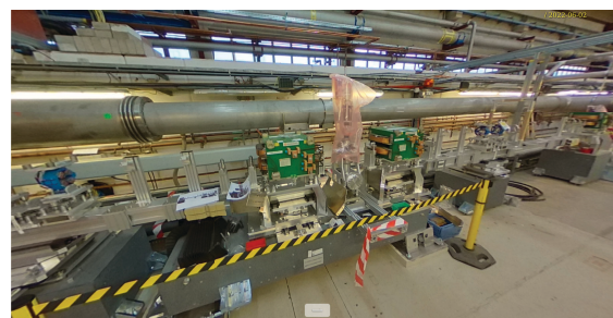
Figure 3: Current assembly status of the 2nd compression chicane (02.06.2022).

In FLASH2 space has been generated for a helical APPLE-III 3rd harmonic afterburner undulator. The last planar undu-