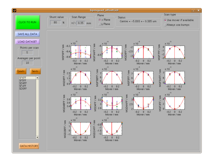
Figure 2: Simulation results for a sextupole.

Controls and Operations T04 - Control Systems