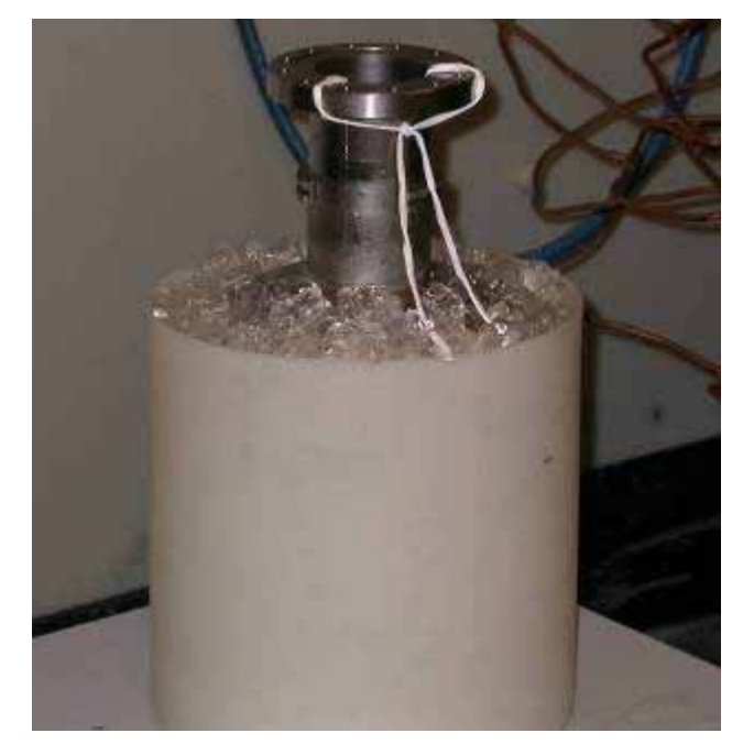
Figure 1: BCP of a single-cell Niowave cavity packed in ice. The white Teflon rope supports a Niobium sample inside the cavity for material removal measurements.