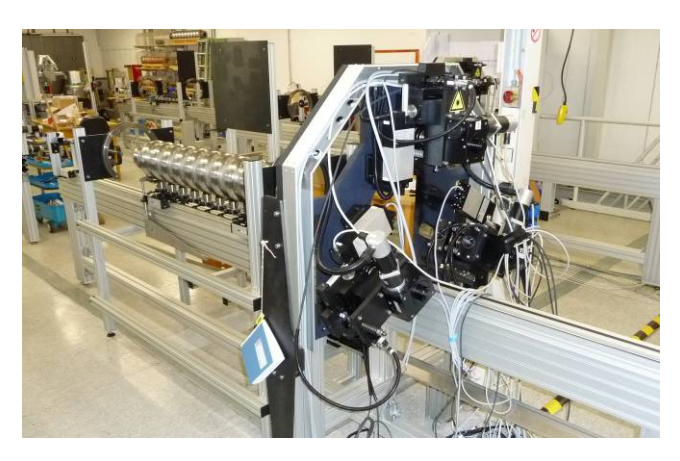
Figure 1: Tuning Machine Mechanical Assembly in Progress.

Motion is provided by six Phytron stepper motors and three Elero linear actuators. The linear actuators move each tuning arm in or out. Stepper motors close or open each tuning jaw, pull the bead, rotate eccentricity measurement potentiometers along the equator of each cell, and transport the cavity along the base frame.