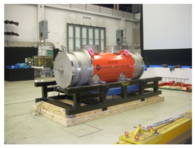
Figure 4: ACC39 delivered to DESY.

At this time the module is receiving a post-transport checkout to verify vacuum leak tightness and that no significant misalignment of the cavity string occurred during transport.