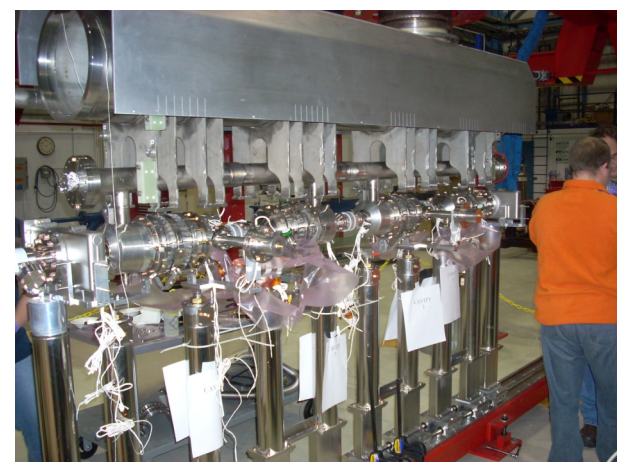
Figure 3: Completed string assembly .

The first four cavities to be tested at the Horizontal Test Stand exceeded design specification and were assigned to be part of the 4-cavity string assembly. Two of the cavities contain the original 2-post Formteil Higher Order Mode (HOM) couplers while the remaining two were fabricated with the re-designed single-post Formteil [3].