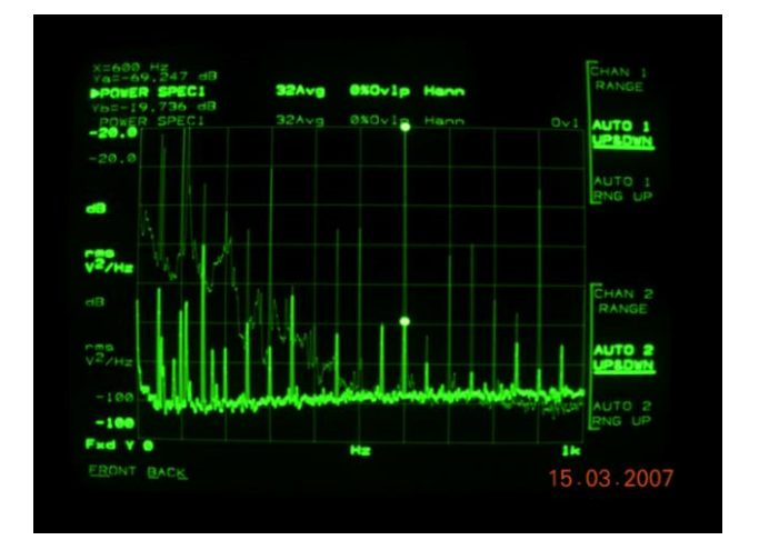
Figure 2: Phase noise spectrum in open loop (faded trace), and with analog/digital loops closed from [6].

trum. The noise floor of the spectrum defines the diffusion coefficients for the beam distribution, as will be shown below. Furthermore, the 50 Hz klystron noise line and its harmonics can interact with the beam motion. In particular, the synchrotron frequency crosses 50 Hz during the LHC ramp, which can significantly affect the beam distribution.