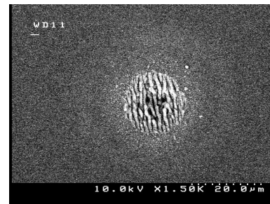
Figure 2: An SEM image of a typical test site after laser induced damage. The fringe pattern is characteristic of multi-shot laser damage.

Silicon has become ubiquitous in the nanofabrication industry and with the overwhelming knowledge-base for processing silicon, it becomes one obvious candidate material. We measured the laser-damage threshold of bulk silicon, in the form of a polished silicon wafer, for a span of wavelengths in the near-to-mid infrared. The laser pulse width was approximately 1ps across all measurements and the laser spot had a Gaussian FWHM on the order of 10\mu\text{m} . An SEM image of a typical damaged test site is shown in Fig. 2. The fringe patterns present in the image is typical of multi-shot laser-damage. A direct comparison of the laser-damage model and experimental data for bulk silicon is shown in Fig. 3.