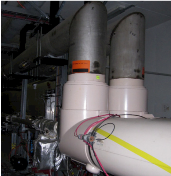
Figure 2: A typical connection between magnet cryostat and transfer line VJP

A typical connection between the magnet and the transfer line cryostat (VJP) in the sextant region is shown Fig. 2. There is a vacuum break in-between the two vacuum chambers. Supporting stand on the magnet cryostat side is anchored to the floor.