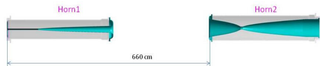
Figure 2: LBNE horns.

element analyses were carried out to guide the design and study the fatigue strength of the inner conductors. Horns will be supported and positioned by support modules, which are capable of aligning and servicing the horn by remote control.