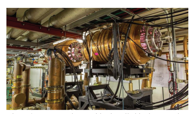
Figure 3: Two complete cavities installed in the Recycler.

between the outer and inner conductors. In this case the cavity was driven through the fast tuner port (with the tuner disconnected). A photo of the cavities installed in the Main Injector tunnel is shown in Figure 3.