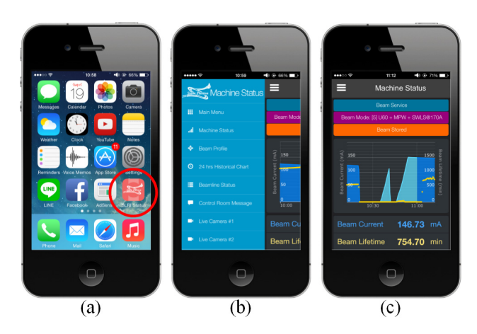
Figure 4: Mobile application: (a) SPS machine status applicon, (b) Slidebars navigator menu, and (c) SPS machine status on mobile device.

An iOS web application was written for iOS-based devices. The web app can be installed from the Safari web browser, and can be accessed later from the iOS home page, as shown in Figure 4(a). The program simply retrieves the machine data from the machine status webpage. When the condition that the user agent is a mobile device is detected, the system will display a specialized frontend framework containing the Slidebars [8] and a navigator menu, as shown in Figure 4(b). The machine status display remains on Bootstrap as mentioned earlier; however, the information is separated into multiple pages to fit the screen resolution of the mobile device, as shown in Figure 4(c).