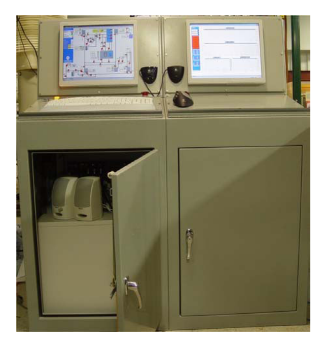
Figure 2: Control panel

All valves (PVDF with viton o-rings) are air driven with spring back return in order to allow for a safe positioning in case of failure. They are equipped with limit switches and manual override. The pumps are air driven, piston or diaphragm type. Both valves and pumps are controlled by solenoidal 24VDC valves rack mounted outside the chemical room. This choice reduces the amount of acid-sensitive or electrically powered elements in the room.