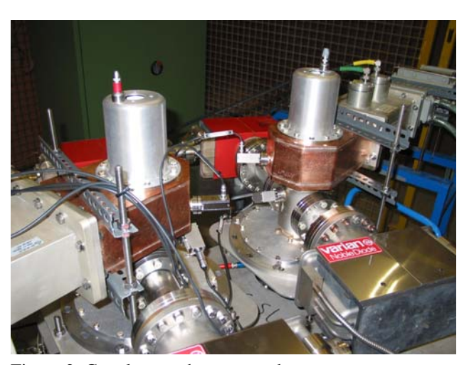
Figure 2: Couplers on the test stand.

The coupler RF test was done in a way it is done for TTF couplers at DESY [11-13]. The couplers parts were assembled on the test stand (Fig. 2) in such a way that RF power transmission through the couplers pair is maximized. Couplers diagnostics is based on the different types of sensors: vacuum gauges, charged particles (e-) and spark detectors and temperature sensors. Each warm part was connected to two ion getter pumps (IGP) having pumping speed of 60 l/s through 150 mm tubes with diameter of 60 mm ensuring the high effective pumping speed. The cold parts mounted on the test waveguide box were pumped out using one IGP. RF power source was Thales 5MW pulsed power 1.3 GHz klystron.