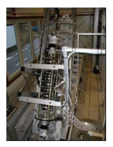
Figure 1: Electro polishing installation at DESY. This system has been copied by industry (ACCEL, Henkel).

- The standard electro polishing (EP) procedure for multi-cell cavities was finalized and is in operation at DESY for more than 150 cavities. This technology was successfully transferred to industry and can be "ordered" now by any present or future project. The European industry now is leader in the industrial EP technology.