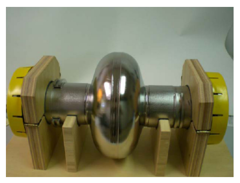
Figure 6: Single crystal Niobium cavity.

- The standard fabrication technology of Nb cavities is to form and weld sheet material of small grain structure. The intrinsic superconducting materials parameters of Niobium might be reduced by the many intermediate steps of forging, baking and etching. Large grain or even single crystal cavities are formed by starting with Nb sheets being cut from the highly purified ingot row material. JRA-SRF has fabricated and tested very successfully several large grain 9-cell resonators and also single cell single crystal cavities. A patent has been granted to the fabrication technology of single crystal single cell cavities. The breakthrough of this novel technology requires R&D effort by the Niobium industry for large scale production of appropriate ingot raw material. This would revolutionize the Niobium cavity fabrication with respect to fabrication cost and cavity performance. JRA-SRF has created one of the world leading centers of excellence in this field.