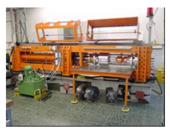
Figure 5: Hydro-forming apparatus for the production of seamless Niobium cavities

- The technology for production of seamless cavities has been finalized. A patent has been granted for this new fabrication technology. Seamless tubes are fabricated by a combination of back extrusion and flow turning. A computer controlled hydraulic machine forms cavity cells from these tubes. The material properties, specification and the forming parameters are well understood and defined. A first 9-cell hydroformed cavity has been successfully tested at a high accelerating gradient of 30 MV/m. This fabrication method is ready to be used in cases where welding defects limit the performance of superconducting cavities. Europe is definitely the leader of this technology.