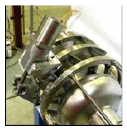
Figure 3: New tuning system for ILC type applications.

- The design and optimization of slow and fast cold tuning systems for cavities is finalized and was approved by prototypes. Two versions are available: tuning mechanism is placed at the end or at the middle of the helium vessel. The first one is the standard solution for FLASH and XFEL type accelerators. The second one is first choice for accelerators where the absolute length is critical, e.g. ILC.