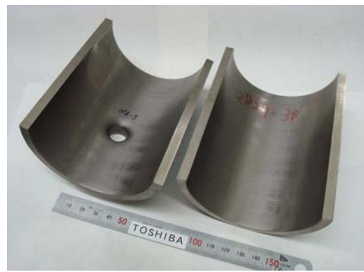
Figure 8: Half-pipes for the beam tube of the 1<sup>st</sup> cavity.

Beam tubes for the 1<sup>st</sup> 9-cell cavity were formed by electron beam welded two half-pipes as shown in Figure 8. It is not suitable to fabricate beam tubes with HOM couplers in this fabrication method. Therefore, development of seamless beam tubes by deep drawing is performed for the 2<sup>nd</sup> 9-cell cavity. Two long cups were formed from niobium disks by three times drawings without intermediate annealing as shown in Figure 9. Figure 10 shows two long cups formed by deep drawing. Two beam tubes will be fabricated by cutting both ends of these long cups.