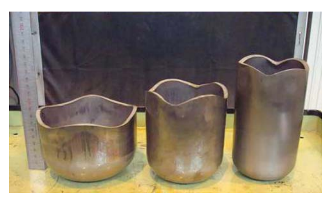
Figure 9: Fabricating process of long cups. (Left: after 1^{st} deep drawing, Center: after 2^{nd} deep drawing, Right: after 3^{rd} deep drawing).