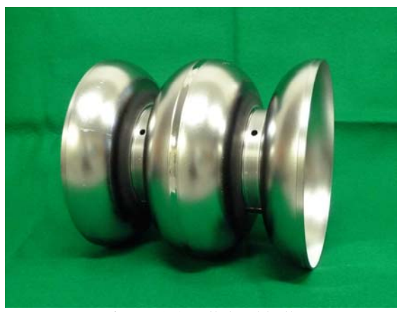
Figure 5: 2-cell dumbbell.