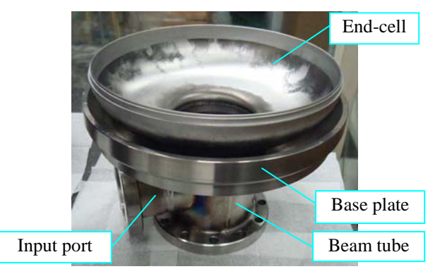
Figure 6: End-group by the side of input port.