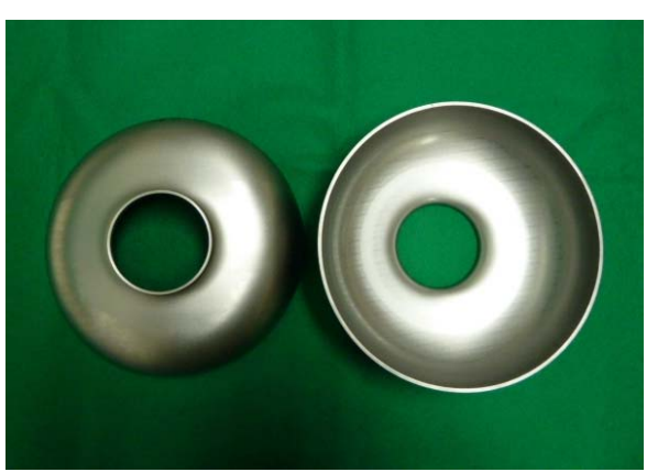
Figure 3: Niobium half-cells.