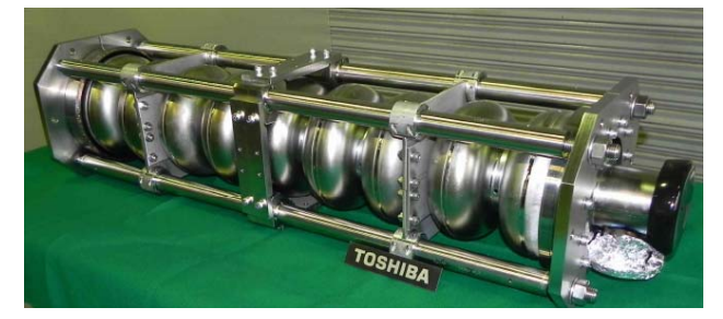
Figure 2: 9-cell superconducting cavity with supporting jig.