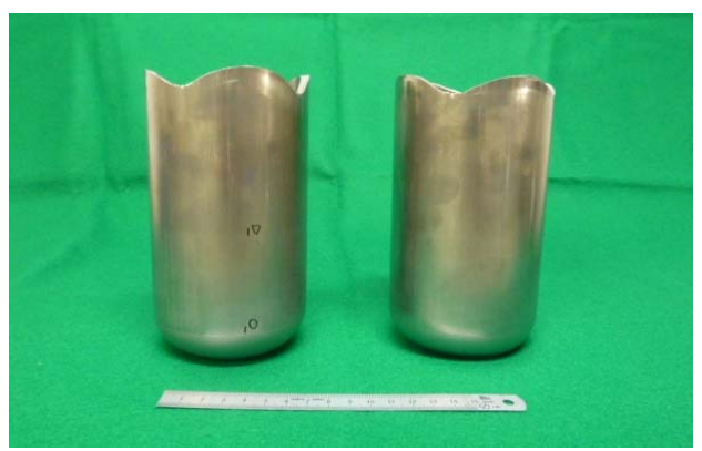
Figure 10: Two long cups formed by deep drawing.