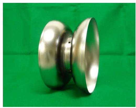
Figure 4: Dumbbell with stiffening rings.