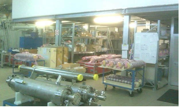
Figure 5: View on production buffer at Ettore Zanon.

The fifty six EZ resonators tested until KW 36/13 reached an average acceleration gradient of 27.6 MV/m. The average of the usable gradient, defined by quality factor of Q >1x10<sup>10</sup> and field- emission level of < 1x10^{-2} -mGy/min, of these cavities is 24.5 MV/m in the first pass. Thirty of the EZ cavities well exceeded gradients of 30 MV/m, one cavity reached up to 37MV /m without field emission loading.