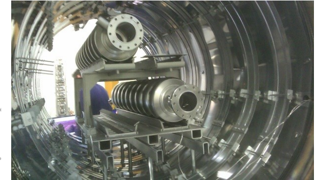
Figure 3: 800 C UHV oven loaded with two XFEL serial cavities.

These cavities are hand out to the EZ SPA and served for the qualification processes RCV 0 to 9 (Table 2).