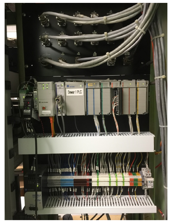
Figure 3: Dewar control PLC and I/O.