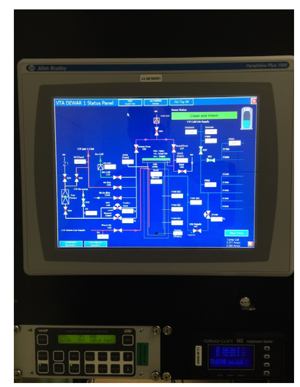
Figure 2: Dewar control HMI.

As soon as each dewar control system was upgraded, the cotrols were commissioned by way of an Operational Acceptance Test (OAT) to ensure proper services (i. e. electrical, pneumatic), followed by a Functional Acceptance Test (FAT) to validate the operation of individual I/O and related interlocks. After both OAT and FAT were successful, a final operational commissioning was accomplished that consisted of a complete, automated cooldown and warm-up cycle. Dewar level sensor calibration was included in this evolution. Once the dewar is returned to service, the next scheduled dewar is taken out of service and the upgrade sequence was repeated.