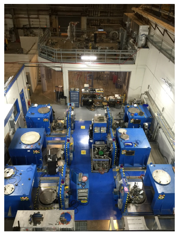
Figure 1: JLab Vertical Test Area (VTA).

while others are performed manually. A complete test cycle for the larger (850 liter capacity) dewars can be accomplished (warm-to-warm) in 36 hours or less. Smaller dewars (100-200 liter capacity) can be cycled in 8 hours (one shift). The combination of automated and interlocked control, along with efficient cryogen and thermal management, yields a facility with an SRF cavity test throughput unequalled anywhere in the world [1][2].