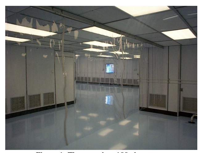
Figure 1: The new class 100 cleanroom.

in the cleanroom [1]. For access of these modules, a 10 ft (3m) by 8ft (2.4m) access door has been installed.