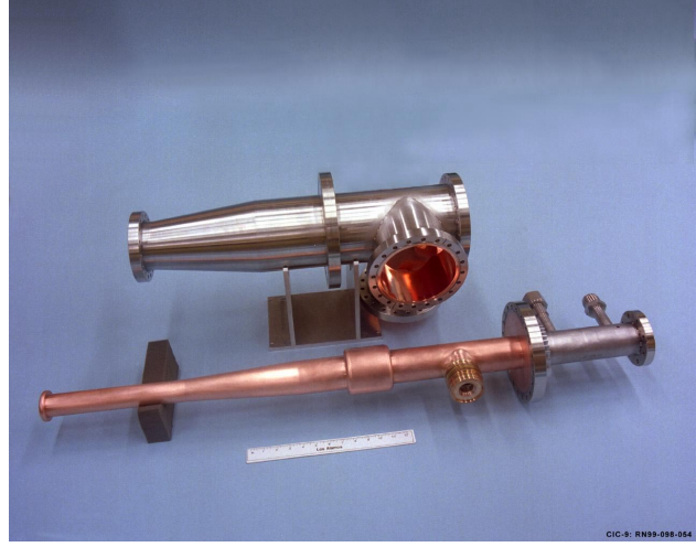
Figure 4: The inner and outer conductor of the APT power coupler.

The RF, mechanical and thermal design [6] of the APT power coupler has been completed and the first couplers and windows have been built. The coaxial coupler design has been done in-house, while the window design has been contracted out to industry. All parts of the coupler have been built in industry.