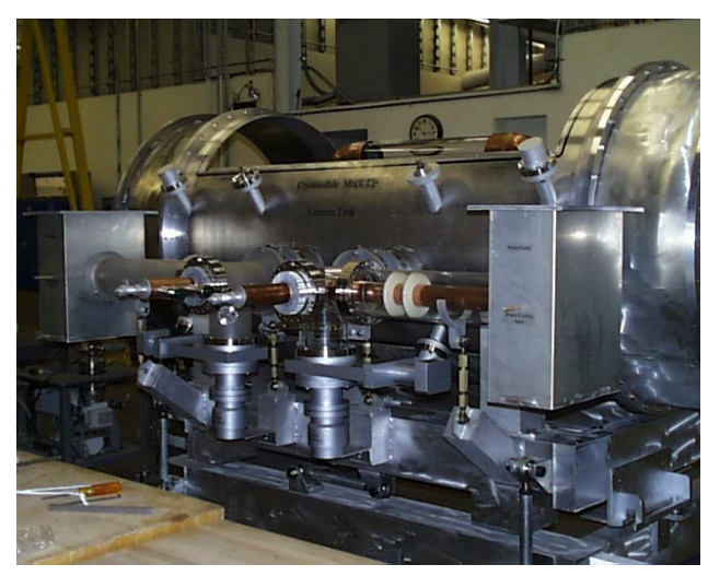
Figure 6: The mocked-up cryo-module is a full size model of the APT cryo-module for the \beta =0.64 cavities.

A cryo-module, based in the CERN wrap-up design [7], has been designed for the APT \beta =0.64 cavities. Different from the CERN approach, the APT design includes 2 power couplers that penetrate the shell horizontally and that due to the warm double-window have to be almost completely assembled in the clean-room. To understand the related issues and added complexity, a full-scale mock-up of the 2-cavity cryostat has been built.