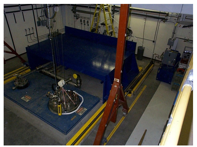
Figure 2: The movable radiation shield in the test area.

cavity temperature during the polishing process. The direct observation of the temperature of the cavity material allows us to control the temperature and keep it below 15° C (288K) during the polish.