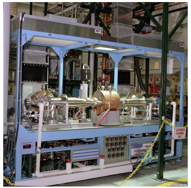
Figure 5: The Room Temperature Test Bed (RTTB) is a test stand for the high power test of the APT couplers.

This allows a very high power transmission with low fields and thus little x-ray production in the cavity.