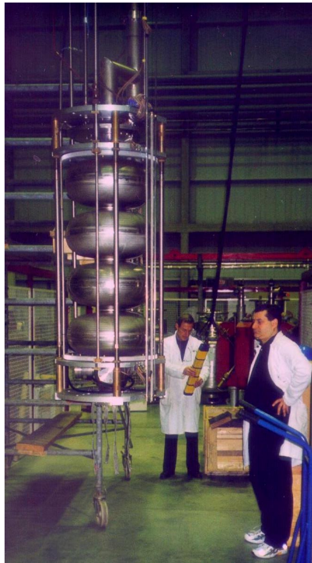
Figure 3: Insertion of a 500 MHz cavity insert into the vertical cryostat.

The 704.4 MHz insert is currently under fabrication. In the meanwhile the test facility will be tested with its original insert to test a spare 500 MHz cavity. The picture of an insertion of the 500 MHz cavity insert into the vertical cryostat is shown in Figure 3.