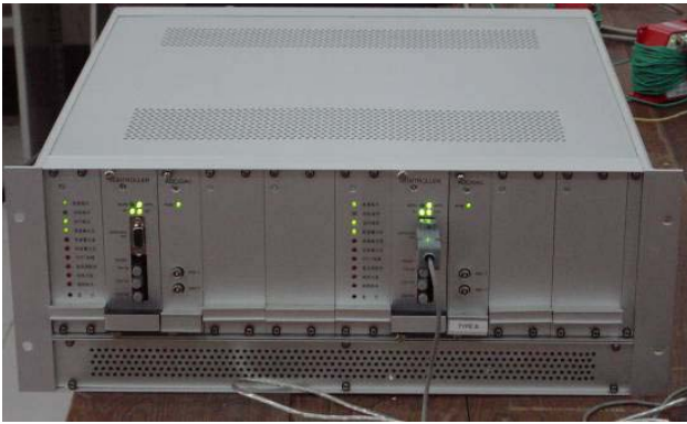
Figure 3: \pm 10\text{A}/25\text{V} bipolar power supply

The home made digital PWM controller can be adopted in linac, which communicate with EPICS via Ethernet and Serial port server.