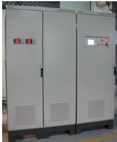
Figure 5: Storage ring power supply

140 sextupoles are divided into 9 groups. A chopper will be employed for the windings of each group in series. The scaled prototype rated of 400A/840V as mention above matches the demand of the sextupole power supplies.