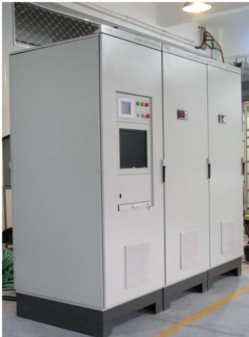
Figure 4: Booster power supply

In SSRF booster ring, two sets of dynamic power supply for 48 bending dipoles run at the repetition rate of 2Hz, which are in two quadrants topology with energy recover and rated of 1150A/1000V. A DC/DC booster chopper is staged in series, so that the voltage fluctuation on the power line could be reduced dramatically. A scaled prototype rated 600A/500V was built and tested, the topologic structure of power has been verified as well. A PSI digital PWM controller will be used in the dynamic power supply as a control master with global current feedback loop. Under digital commands from the central control system, PSI controller produces PWM outputs which be converted into analog voltage via a special circuit. This control voltage is then delivered to the analog PWM controllers, which has been designed to manipulate a power module with local feedback loop.