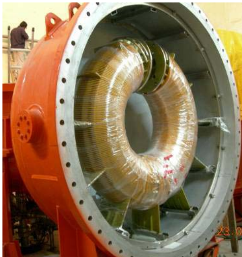
Figure 3: 150kV-0-150kV/120kHz transformer

The 150 kV - 0 -150 kV (peak), 120 kHz source is generated [3] by class-C push pull vacuum tube oscillator operating in Colpits configuration and a resonant transformer. The self capacitance between RF electrodes and the secondary inductance of the transformer forms the tank circuit for the oscillator. Feedback for the oscillator is derived by configuring electrodes in between RF feeder electrodes and pressure vessel. The transformer is an air-core in toroidal geometry, made using 2464 strand, 40 AWG