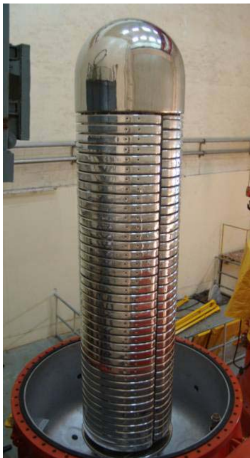
Figure 5: High Voltage Assembly