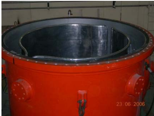
Figure 2: Feeder Electrode Assembled inside the Pressure Vessel

cylindrical feeder electrodes. The feeder electrode assembly supported on the insulators inside the pressure vessel is shown in fig.2. Power from the feeder electrodes is coupled to an array of semi-circular corona guards of the voltage multiplier column through the inter-electrode capacitances between each corona guard and the RF electrode. The coupled voltage between two opposite corona guard is about 50 kV (peak). These stage voltages are rectified using 68 numbers of high frequency rectifier stacks and cascaded to achieve 3 MV DC. Extra corona guard electrodes are provided for extracting auxiliary power at the high voltage terminal and for ripple filter.