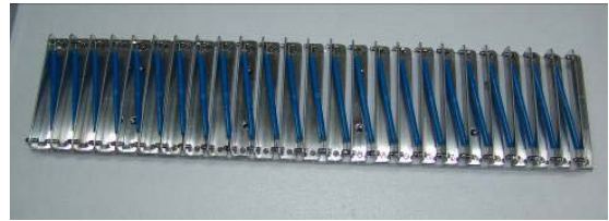
Figure 4: 750kV Voltage Divider Module

The high voltage multiplier column is assembled around the accelerating column on an acrylic support structure. Height of the voltage multiplier column is made nearly equal to the accelerating column to minimize radial electric field stress between them. Components dimensions and geometries are designed to limit electric fields less than 160 kV/cm with 6kg/cm 2 SF 6 gas environment. For measurement of 3 MV DC a voltage divider chain made into 4 modules is attached on the high voltage column. A photograph of the voltage divider module is shown in fig.4.