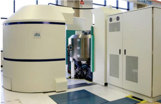
Figure 2: View of the Eclipse cyclotron.

Experiments were conducted on the Siemens Eclipse Cyclotron [2], an example of is shown in Figure 2.