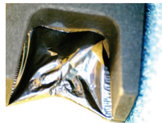
Figure 4: A damaged graphene foil.

Figure 4 shows a picture of damaged graphene foil as observed at the end of this lifetime test.