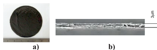
Figure 1: General view of graphene foils: a) fabricated foil; b) graphene cross section.

The experiments with graphene foils with a thickness of about 3 \mu\text{m} (0.5mg/cm 2 ) were conducted on four Siemens Eclipse cyclotrons. The graphene foils were installed on the carousels of the Eclipse cyclotron. The general picture of the graphene material is shown in Figure 1.