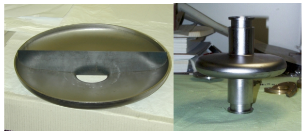
Figure 1: A 700 MHz \beta=0.5 niobium half-cell deep drawn by Zanon, ready for welding, and a scaled (one half) single cell cavity.

The TRASCO program involves industrial partners for the developments of prototypes of the accelerator components. The Italian company Zanon, which is fabricating all the cryomodules and part of the niobium cavities for the TESLA Test Facility (TTF), will deliver the first prototype \beta=0.5 single cell cavity (with low grade RRR=50 niobium) by the end of June 2000. The niobium half-cells have already been drawn (see Fig.1), the tooling has been already fabricated and the cavity is being welded. This cavity will be chemically treated and tested in Saclay, and used to qualify the cavity test bench in Milano (see Fig. 2) by Fall 2000. A scaled (1400 MHz) single cell model, shown in Fig. 1, has been welded and is under test in Genova.