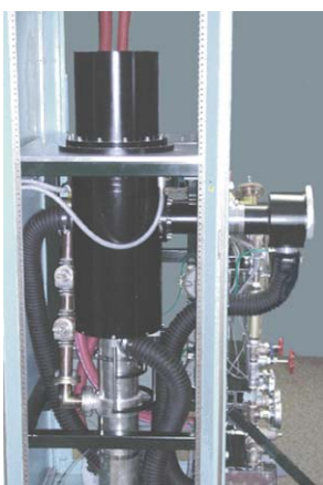
Figure 2: New IPA Ready for Testing