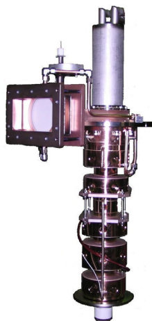
Figure 6: 1.3GHz, CW klystron E3750,RD.

TETD has been developing with KEK, an L-band CW klystron E3750,RD, which will be employed as an RF source for the main accelerator in ERL (Energy Recovery Linac). Test results of the prototype are listed in Table 4, and its outside view is on Fig. 6. With beam voltage of 20.5 kV and beam current of 2.48 A, the maximum output power reached 30 kW, which is more than a required value 25 kW, and efficiency marked about 60% as described in Fig. 7.