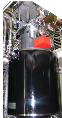
Figure 1: 2856-MHz, 50-MW klystron E37306.

where the latter is an S-band klystron with a single-cell output circuit. It is clearly seen that output power of E37306, with three-cell output circuit, is less sensitive to magnetic field variation.