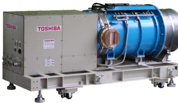
Figure 3: 1.3-GHz, 10-MW horizontally-oriented multi-beam klystron E3736H.