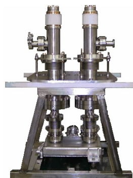
Figure 4: 1.3GHz high-power input coupler E42100.