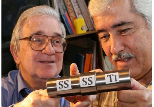
Figure 4. Explosion welding of bimetal tubes.

Specialists from JINR and VNIIEF (Sarov) have studied the possibility to produce a tube of bimetal type (stainless steel and titanium) by explosion welding (Fig.4). The tube is used as a transitional load-bearing element in the 4th generation cryomodule construction for the ILC.