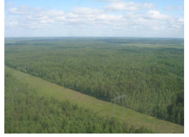
Figure 2. The view of ILC proposed area from helicopter.

the form of single hills and ridges have smoothed shapes, soft outlines and small excesses. The territory of the area is waterlogged. The absolute marks of the surface range from 125 to 135 m with regard to the Baltic Sea level.