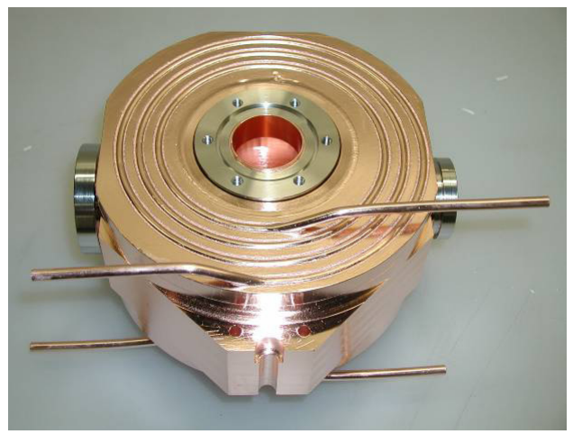
Figure 3: The prototype RF cavity.

As EMMA is an experimental machine having sufficient diagnostics is crucial. The current requirements and how they will be met are summarised in Table 3. The diagnostic devices will be mounted in the injection line, to measure the beam properties into EMMA, and in the ring itself. Destructive diagnostics will be mounted in an external extraction line. The machine extraction system has been designed to allow extraction, and hence the use of these devices, at any energy. The table shows the number of devices in each of these locations.