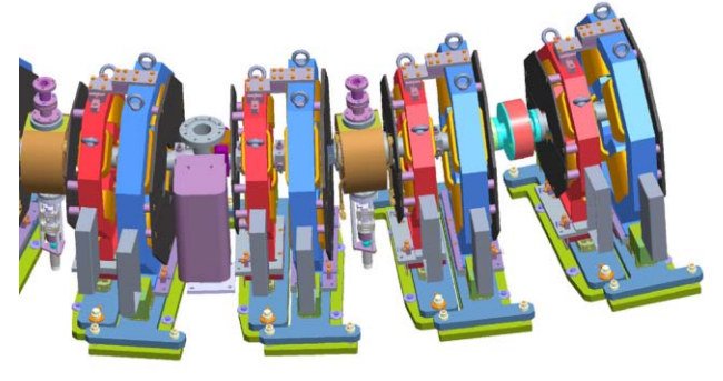
Figure 1: Four EMMA cells, showing the magnets mounted on sliders. Between the middle two cells is an RF cavity. The right gap has a resistive wall monitor and the left an ion pump.

The design of the full layout of EMMA is now essentially complete and is shown in Figure 2. EMMA will be built at the STFC Daresbury Laboratory and will use the ALICE accelerator [7] as an injector. ALICE is able to deliver a bunch of sufficient brightness at any energy between 10 and 20 MeV, an important criterion for the experimental programme of EMMA.